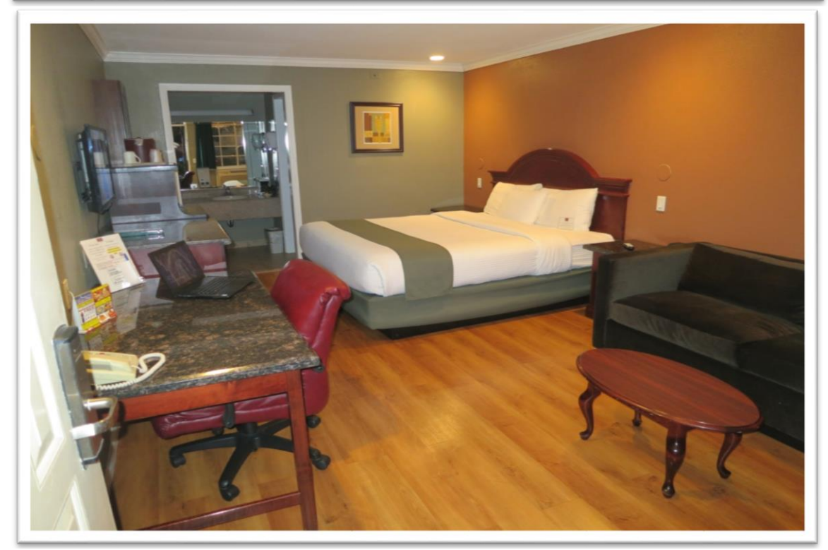
ONE KING BED WITH SOFA BED